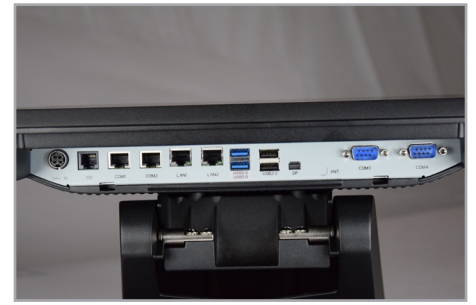
Easy access to communication ports