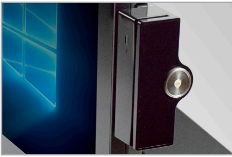
Magnetic card reader with i-button optional